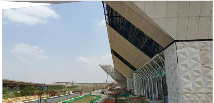
YASHOBHOOMI, INDIA INTERNATIONAL CONVENTION & EXPO CENTRE, DWARKA, NEW DELHI