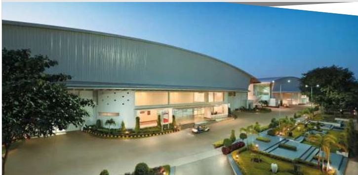
BANGALORE INTERNATIONAL EXHIBITION CENTER, BENGALURU